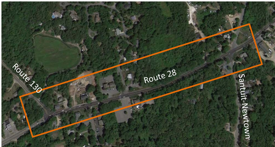
FIGURE 1 - ROUTE 28 COTUIT STUDY AREA