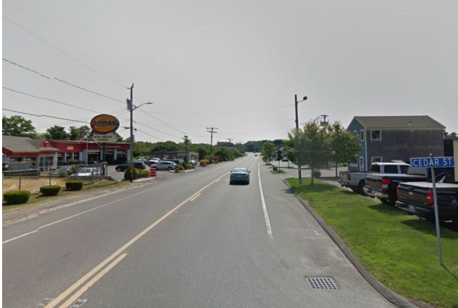
Figure 1 - East Hyannis Route 28 study area