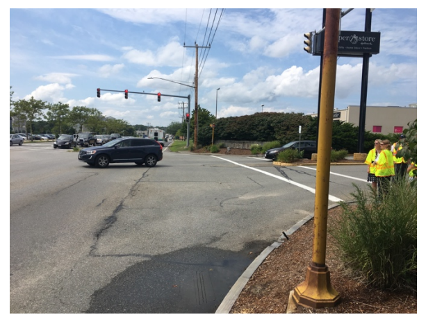
Pedestrians are hidden from drivers' view when leaving Capetown Plaza.