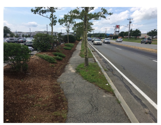
Sidewalk conditions along Route 132 are challenging.

Sidewalks in the study area vary in width and material. Sidewalks measure approximately 3' wide to 5' wide, with the newer sections being wider than the older sections. Asphalt sidewalks run along Route 132, and sidewalks leading to the Cape Cod Mall are concrete. There are no sidewalks leading to Capetown Plaza. Curb ramps either are not present or do not meet current ADA requirements at most driveways and intersections. The recent upgrade of the Independence Drive/Route 132 intersection includes ADA compliant ramps and a crosswalk across only the southern Independence Drive approach. As observed during the walk audit, people in wheelchairs have incredible difficulty navigating along Route 132 and are forced into the street to reach their destinations.