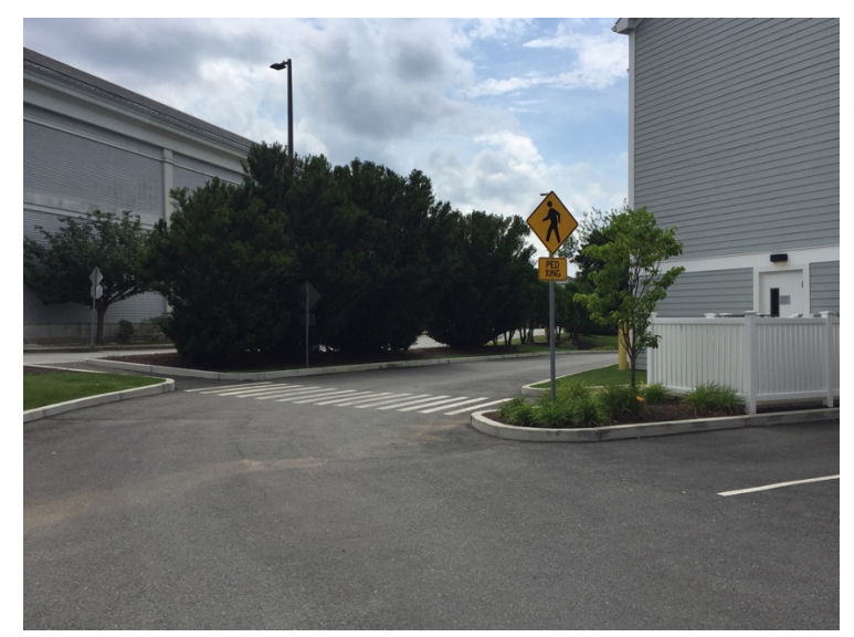
Pedestrian access to the Cape Cod Mall from the Fairfield Inn.

In addition to promoting internal vehicular circulation, pedestrians and business owners would benefit from a network of connected walkways. People now walk through parking lots and service drives to reach their destinations. Marked, signed pathways — which could include the amount of time it takes to walk from one place to another — would help people shop, dine and move between destinations after parking their car once and walking. The pedestrian connection between the Fairfield Inn and the Cape Cod Mall parking lot is a good example of providing safe access between properties.