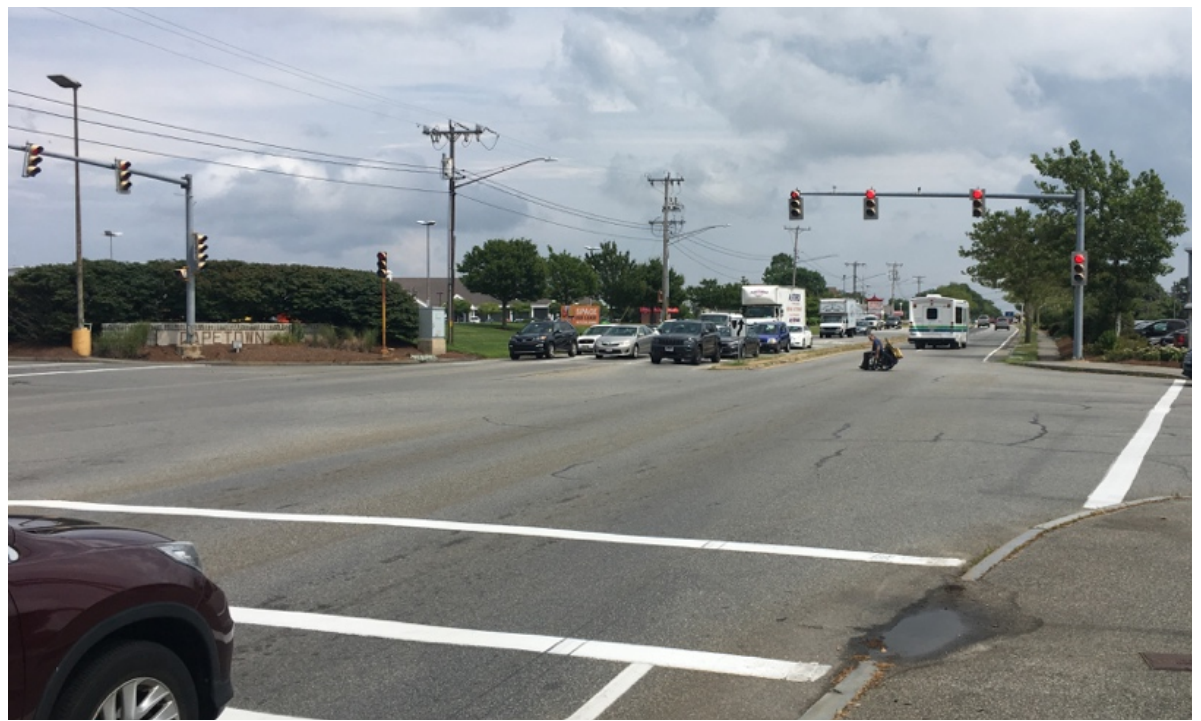
After navigating up the hill from the Cape Cod mall on the entrance road, this man in his wheelchair crossed Route 132 outside the crosswalk and proceeded up the Capetown Plaza entrance road within the travelway since no sidewalk was available.

Sidewalks in the study area vary in width and material. Sidewalks measure approximately 3' wide to 5' wide, with the newer sections being wider than the older sections. Asphalt sidewalks run along Route 132, and sidewalks leading to the Cape Cod Mall are concrete. There are no sidewalks leading to Capetown Plaza. Curb ramps either are not present or do not meet current ADA requirements at most driveways and intersections. The recent upgrade of the Independence Drive/Route 132 intersection includes ADA compliant ramps and a crosswalk across only the southern Independence Drive approach. As observed during the walk audit, people in wheelchairs have incredible difficulty navigating along Route 132 and are forced into the street to reach their destinations.