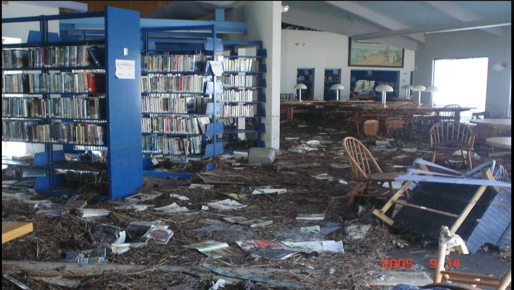
Biloxi Public Library, MS