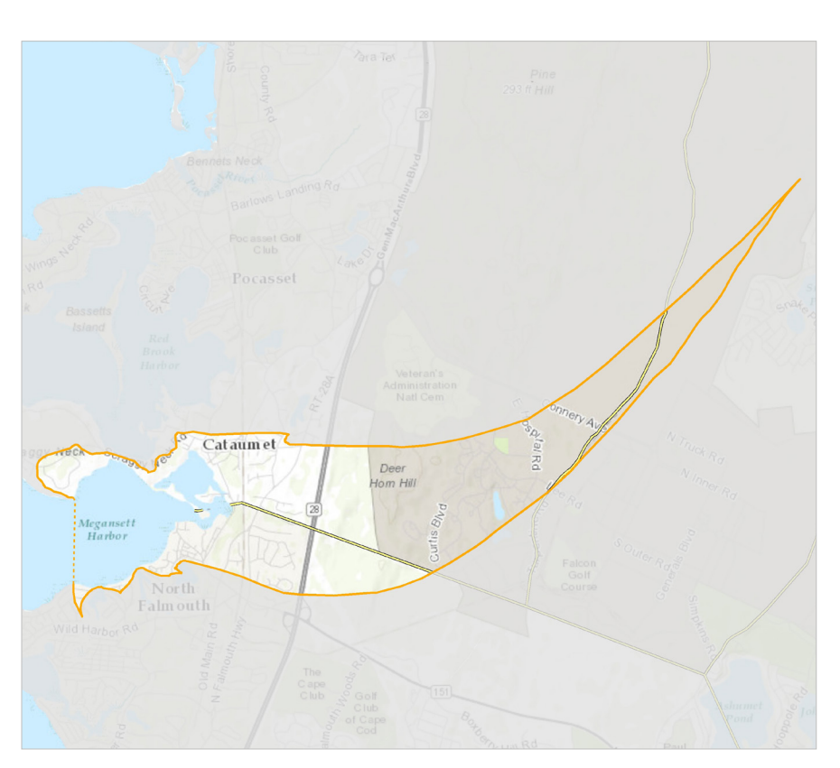
Megansett Harbor Watershed