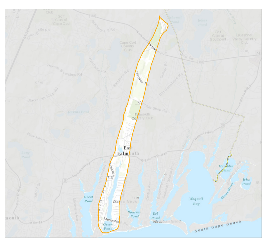
Green Pond Watershed