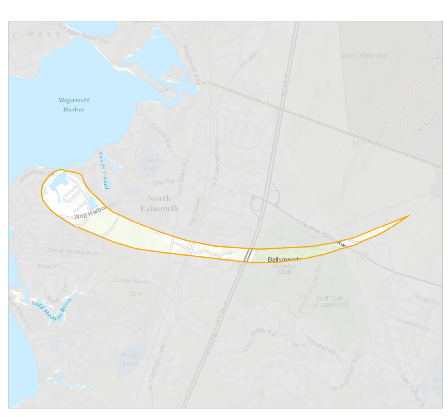
Fiddlers Cove Watershed