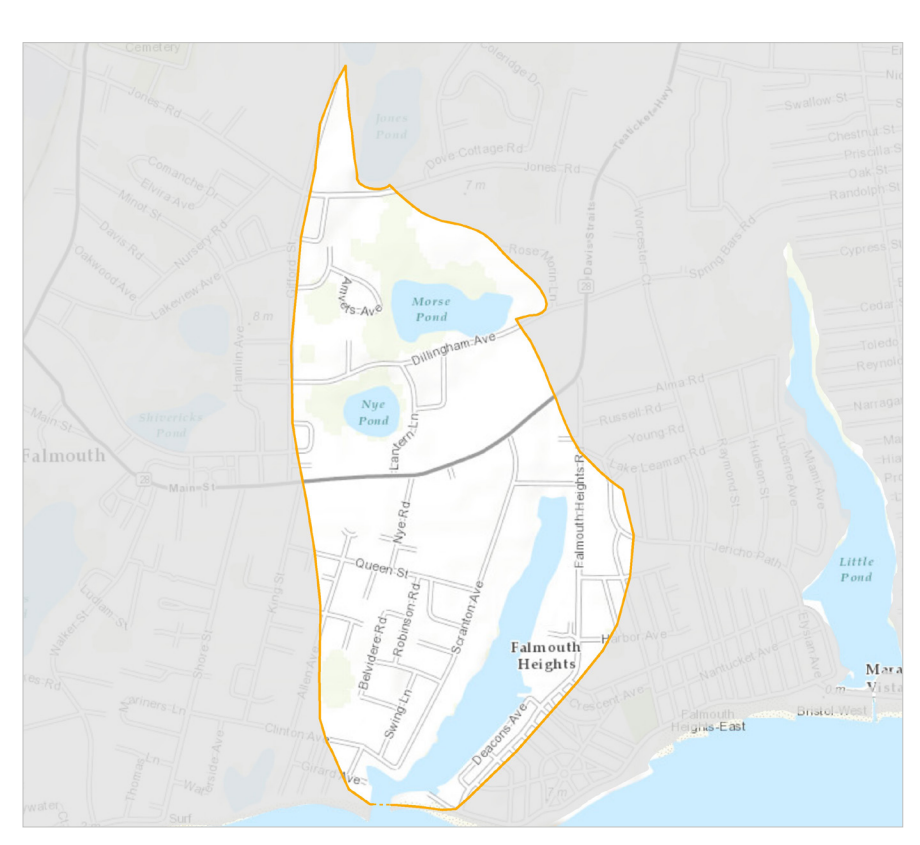
Falmouth Inner Harbor Watershed