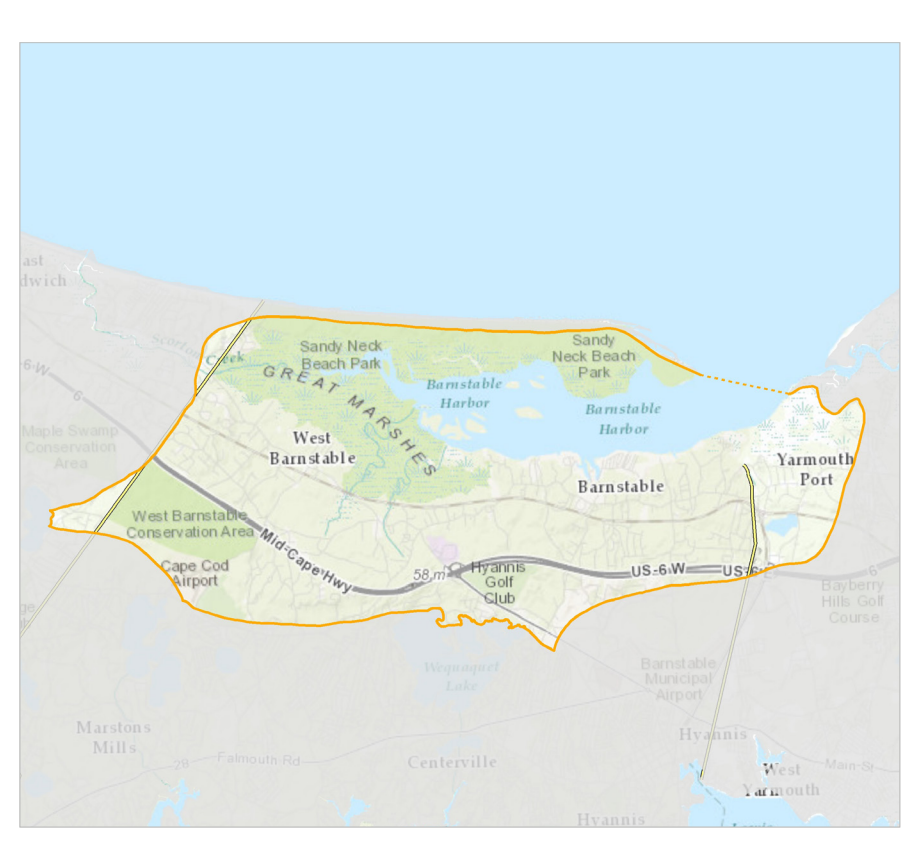
Barnstable Harbor Watershed