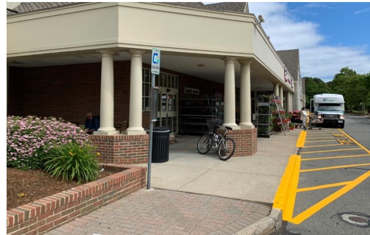
Figure 14: Exterior View of the Bus Shelter at the Stop & Shop