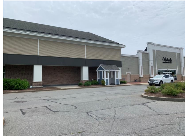
Figure 4: Bus Stop at the Falmouth Mall