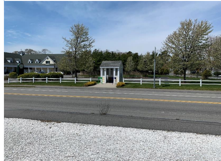
Figure 21: External View of Dennis Common Bus Stop (Looking from Across the Street)