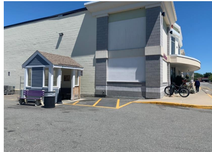
Figure 7: External View of the Orleans Stop & Shop Bus Stop