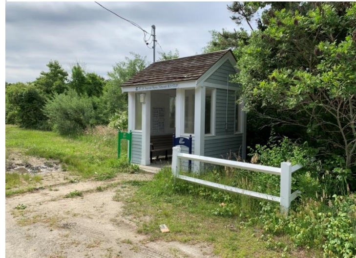
Figure 18: Exterior View at the Seacoast Shores Boulevard Bus Stop