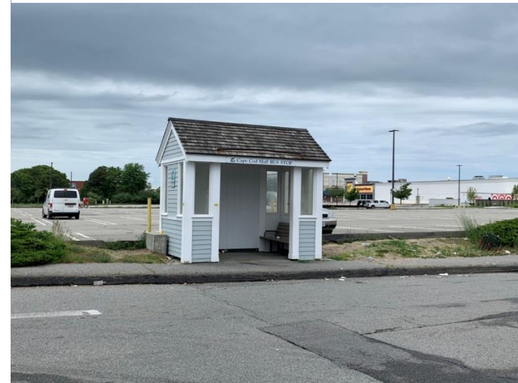
Figure 9: Bus Stop at the Cape Cod Mall Entrance