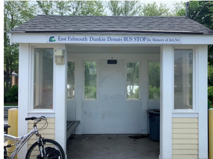
Figure 10: Bus Stop at the East Falmouth Dunkin Donuts