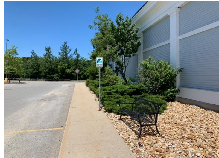
Figure 12: Bus Stop in Front of Marshall's