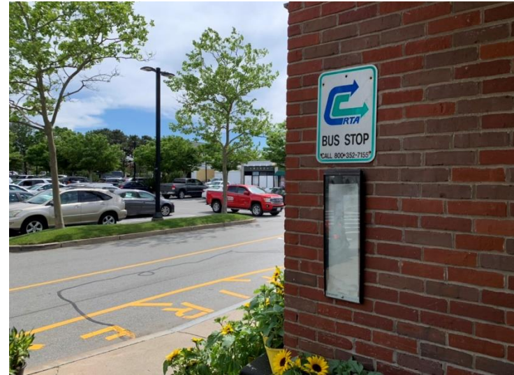
Figure 5: Bus Stop at the Mashpee Commons Stop & Shop