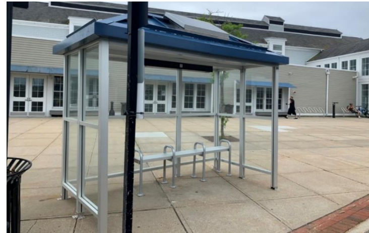
Figure 2: Image of Bus Stop at the Hyannis Transportation Center