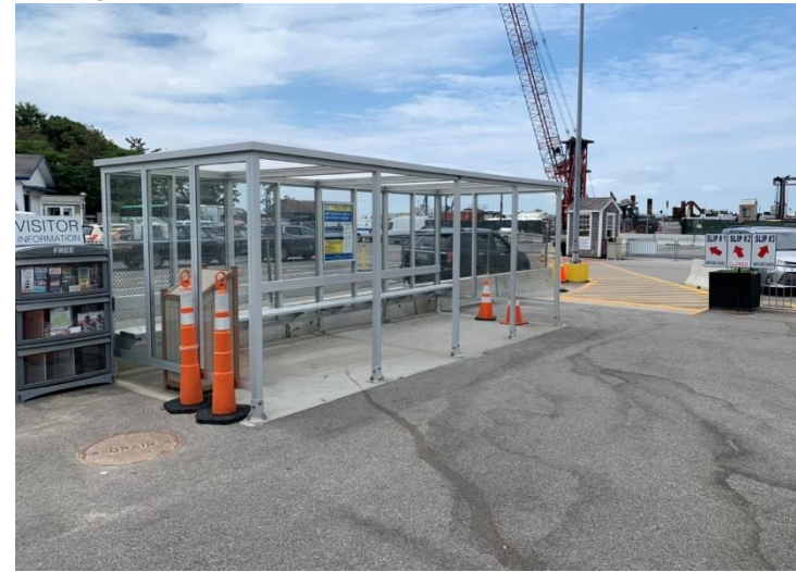
Figure 6: Image of Bus Stop at the Steamship Authority Ferry Dock Parking Lot