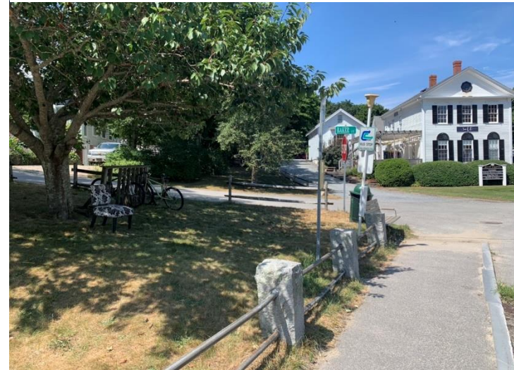
Figure 16: Bus Stop in Wellfleet Center