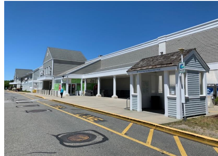
Figure 13: Exterior View of the Bus Shelter