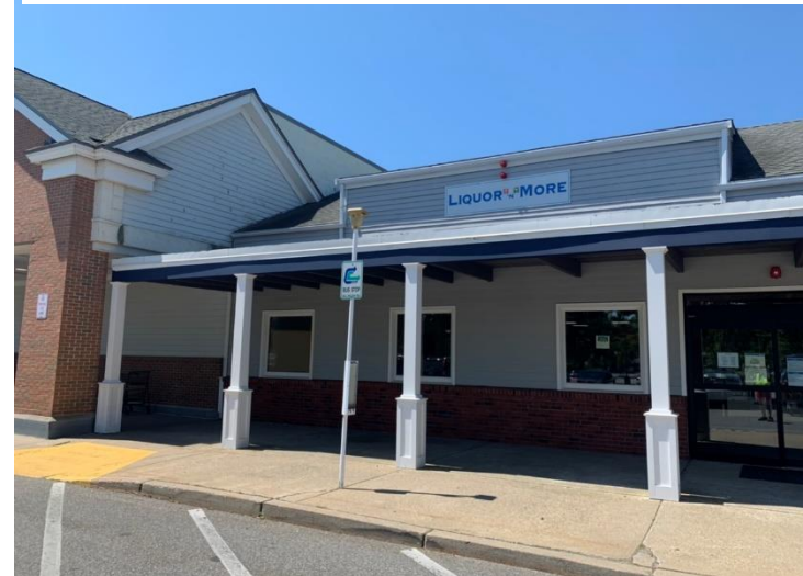
Figure 20: External View of Bus Stop with Signpost and CCRTA Sign