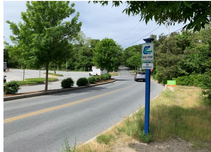
Figure 17: Existing Signpost with CCRTA Logo at the Bus Stop