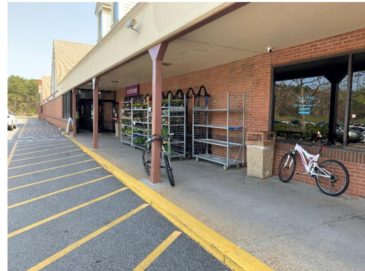
Figure 8: Bus Stop at Patriot Square (at Stop & Shop)