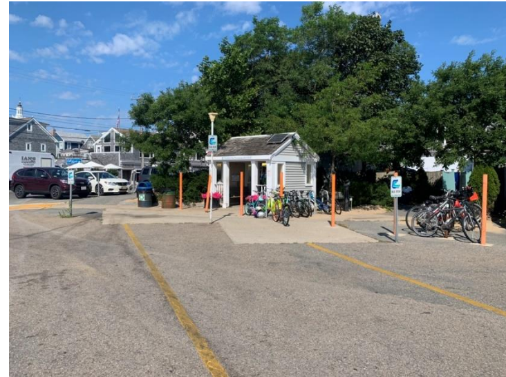
Figure 3: The Bus Stop is Located Adjacent to a Parking Lot