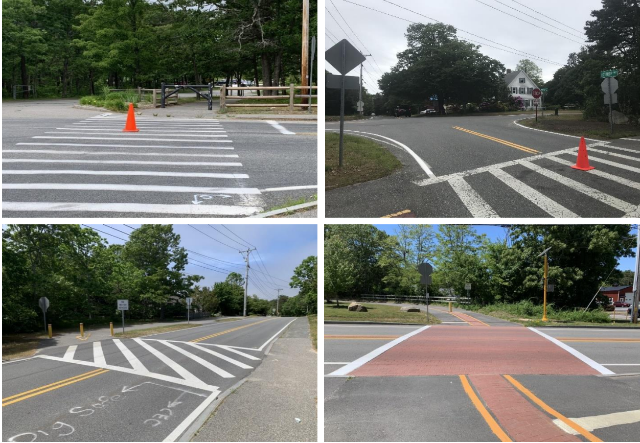
Figure 1: Continental Crosswalk (top left); Ladder Crosswalk (top right); Zebra Crosswalk (bottom left); Painted crosswalk (bottom right). Images are all from Barnstable County locations.