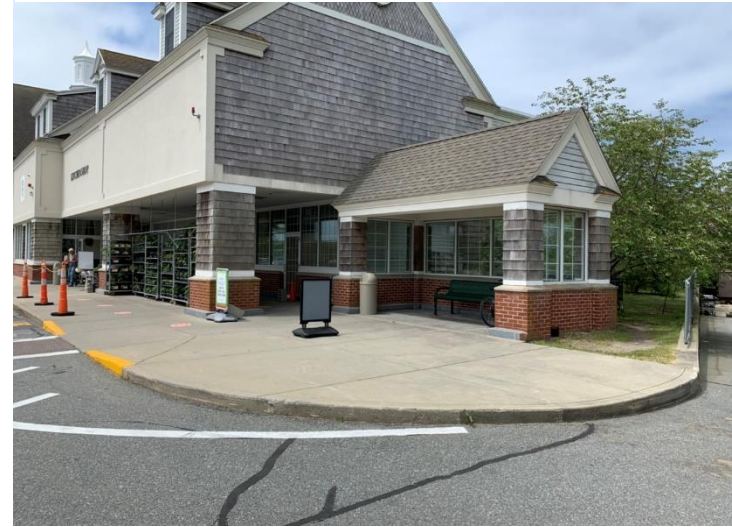
Figure 11: Bus Stop at the Star Market. Note Lack of Signage