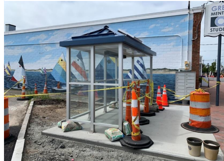
Figure 15: Exterior View of the Bus Shelter at Municipal Lot A