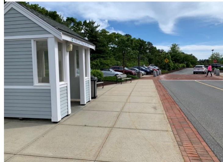
Figure 19: South Cape Village Bus Stop Near Parking Lot