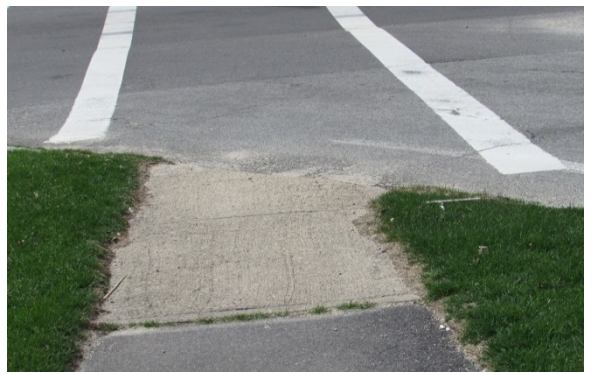
Existing Crosswalk Markings and Ramp

Observations made during the RSA indicate that the intersection is lacking pedestrian amenities, including pedestrian signals and sidewalks on the northern side of Route 28. Another observation was made regarding the lack of tactile pads on the existing handicapped ramps. It was also mentioned that the residential neighborhoods on the north side of Route 28 lack pedestrian connectivity due to the lack of pedestrian