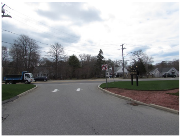
Egress Point from CVS to Route 28

amount of access points along the corridor through the use of shared driveways. One particular driveway discussed during the audit was the "right-in, right-out" CVS driveway east of the intersection, which provides access from and to Route 28 in the westbound direction. The egress point of the driveway onto the corridor is currently restricted to right turns only by a sign and a scored median. However, the consensus amongst the RSA team was that left turns into and out of this driveway continue to occur, creating a potential safety risk. In general, the concerns in terms of access management related to the egress from the CVS driveway onto Route 28, as well as the frequency of driveways along the corridor.