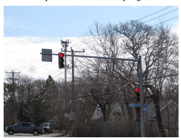
Lack of Backplates on Existing Signal Heads

impediment at a red light, and the issue is related to all four of the approaches. Upon review of the past three years of crash data, it becomes apparent that a number of the rear end crashes throughout the intersection could be a result of the traffic control. Another observation was made regarding the significant morning peak volume in the eastbound direction at the intersection. Although the intersection possesses exclusive left turn lanes in both the eastbound and westbound directions, there is a lack of a left-turn signal arrow in either direction. Given the seasonal peak volume on Route 28 in combination with the speed limit of 45 mph, the lack of a left turn signal arrow presents a safety concern.