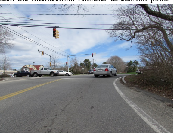
Strawberry Hill Road Northbound Approach

Sight distance at the intersection was also raised as an issue by several RSA participants. From the northbound approach, the sight distance is impacted by vegetation on the southeast corner that is encroaching onto the roadway, as well as the uphill grade on the northbound approach. In regards to the southbound approach, there is a horizontal curve at the intersection of Strawberry Hill Road and Wequaquet Lane, which impacts the sight distance of drivers approaching the Roadway Alignment and Grade from intersection.