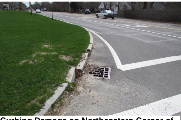
Curbing Damage on Northeastern Corner of Intersection

Throughout the discussion, one of the RSA team members presented a safety issue related to the snow plowing efforts at the intersection. The issue pertains to the placement of the snow bank on the southwest corner of the intersection during snow removal. In regards to safety, the snow bank must be placed further back to avoid impeding traffic on that particular leg of the intersection. It was noted that MassDOT performs plowing along Route 28, while the Town plows Strawberry Hill Road, which often leaves the intersection corners unplowed during snowstorms.