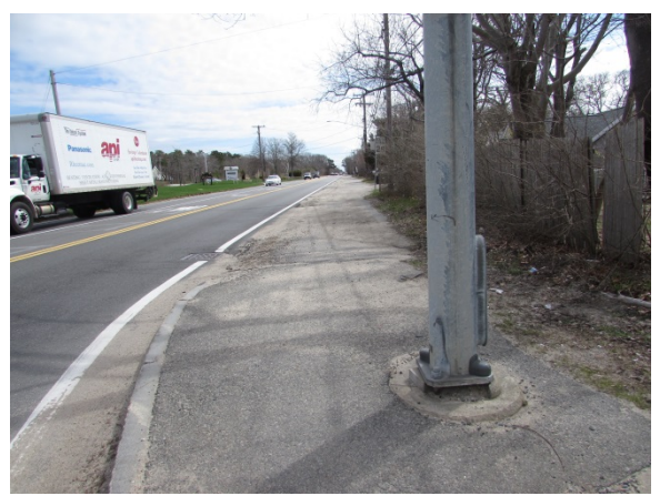
Mixed Use Path on Southeastern Corner of Route 28 and Strawberry Hill Road Intersection

In regards to the mixed use path, the section that is located on the eastern side of the intersection exhibits poor conditions and the lack of curbing presents a safety concern. During the field visit, it was observed that the mixed use path stop sign height may present an issue for cyclists crossing the southern leg of the intersection. The group also recognized the lack of lighting along the mixed use path and raised that as a safety concern.