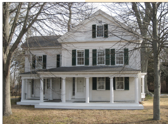
A Greek Revival-style residence in Orleans, Massachusetts