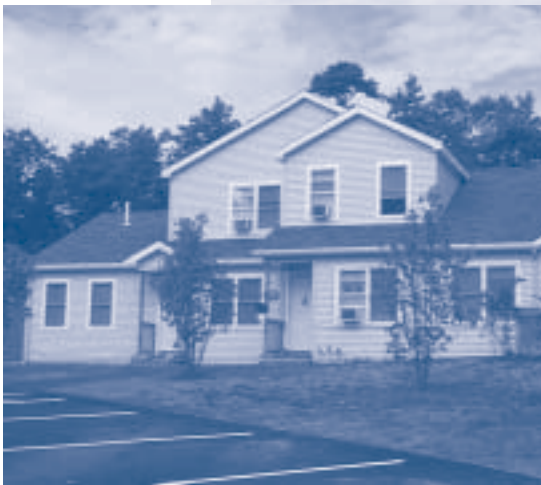
Osprey Lane, Sandwich