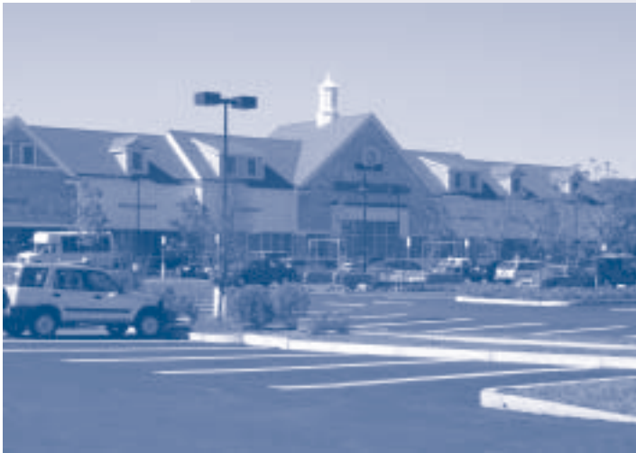
Shaw's Supermarket, Harwich

project will allow the Commission and the Cape Light Compact to create a regional “suitability” map showing the most appropriate locations for siting wind facilities, to conduct a technical and economic feasibility review of wind-energy technologies, and to develop a model local bylaw for wind-power facilities.