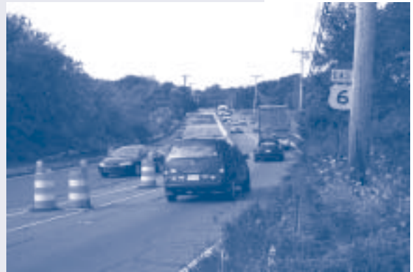
Road work on Route 6 near Governor Prence Road, Eastham

In April 2003, Executive Director Margo Fenn was appointed to serve on Massachusetts Governor Mitt Romney's Highway Design Manual Task Force. The task force is charged with creation of a new highway design manual consistent with the Governor's "Communities First" Initiative.