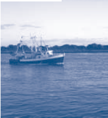
A fishing vessel in the Cape Cod Canal

Potential changes in ocean management prompted by the Pew Oceans Commission, the U.S. Commission on Ocean Policy, and the new Massachusetts Ocean Management Task Force may affect the way coastal resources are managed and the manner in which Cape communities retain their historic ties to the sea. It is broadly acknowledged that the existing patchwork of jurisdictions and incoherent partitioning of the oceans for fishery management, resource protection, and special uses require a more cohesive approach to ocean management at federal and state levels. The Commission continues to advocate for the Cape's interests to ensure that policies make sense for resource management in Barnstable County.