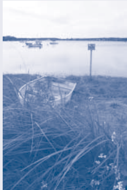
Oyster Pond, Chatham

One activity that will contribute to decisions on future wastewater infrastructure for Cape Cod is the Massachusetts Estuaries Project, which will address water quality in the Cape's embayments. Of the first 20 priority embayments identified for the project, 15 are on Cape Cod. The School of Marine Science and Technology at the University of Massachusetts-Dartmouth is conducting the project for the Massachusetts Department of Environmental Protection; the Commission's Water Resources program is one of the technical partners. The project will determine embayment-specific nitrogen-loading management criteria and provide preliminary restoration scenarios, which in turn will be the basis for potential wastewater infrastructure changes.