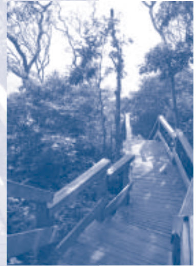
Access to a coastal trail in Chatham

The Commission coordinated the ninth annual Walking Weekend in October 2002, holding workshops and brainstorming sessions beforehand to reenergize local leaders and organizers for the Pathways effort. In addition, the Commission organized a Pathways clean-up day in June. With help from AmeriCorps Cape Cod, the Commission also created detailed maps of Pathways trail segments with a global positioning system, or GPS, unit.