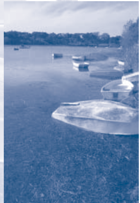
Little Mill Pond, a nutrient-rich embayment in Chatham

The newly established Barnstable County Wastewater Implementation Committee (WIC), which is coordinated by the Commission’s Water Resources program, provides a regional forum for discussing and capitalizing on regional opportunities for effective wastewater management and for receiving input for the development of a new regional wastewater management plan for Cape Cod. In its first year, the WIC met nine times and provided input on the wastewater facility planning process, provided local information for a matrix of wastewater needs in Cape communities, developed a request for proposals for consultants to evaluate options for establishing wastewater management districts, and began a land-use analysis of wastewater needs and facility siting criteria. Much of the WIC’s work was documented in the Commission’s report to the Massachusetts Department of Environmental Protection on the Cape Cod Comprehensive Regional Wastewater Management Strategy Development Project . More than 200 copies of the report were printed and distributed throughout the region. The WIC continues to work with the Barnstable County Commissioners and the Assembly of Delegates to coordinate use of the county Wastewater Management Reserve fund for local municipal grants and other activities.