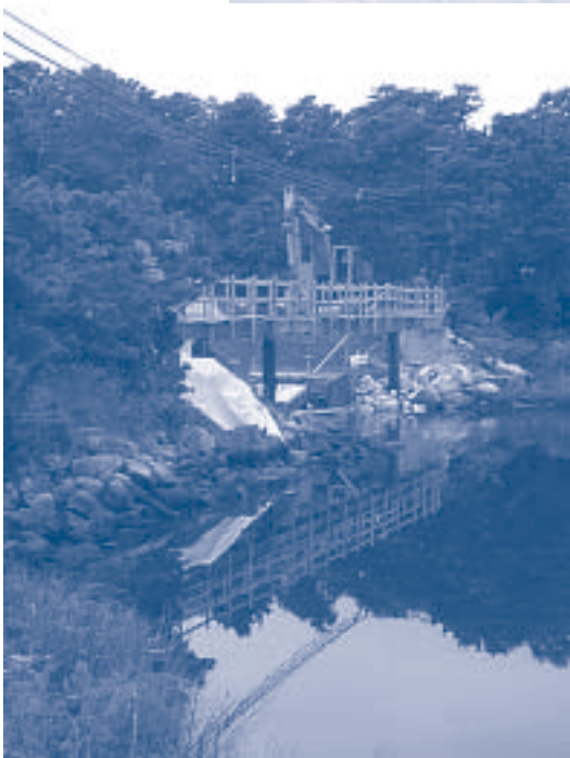
Reconstruction of the Meadow Neck Road Bridge, Waquoit

The Commission's staff also continued to support the work of the Cape Cod Transit Task Force. The task force continues to work to improve coordination of Cape Cod Regional Transit Authority services with other providers, to design a set of Cape Cod-style transportation-support shelters around the region, to enhance transit service on the Outer Cape, and more.