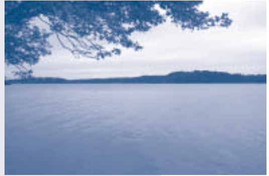
Long Pond, Harwich

The Commission staff also responded to a request from the Association to Preserve Cape Cod to manage their pond-level monitoring network, expanding the number of ponds in the network to 29. Commission staff also worked with a number of pond associations and key pond and lake stewards throughout the year to assist in developing sampling programs, to provide technical interpretation of sampling data, and to help secure funding to support stewardship and/or sampling programs.