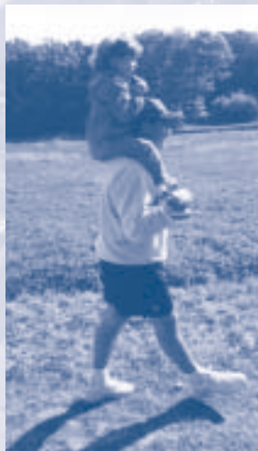
Hitching a ride during Walking Weekend 2002