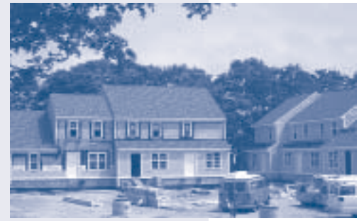
Southside Village, Hyannis

Last year the Barnstable County Commissioners and Assembly of Delegates allocated $500,000 toward these activities: