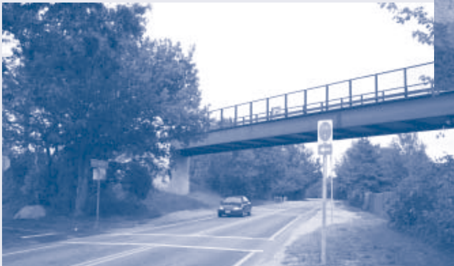
Completed Cape Cod Rail Trail bridge over Rock Harbor Road and Route 6 in Orleans