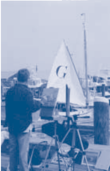
Artist at work during the 2003 Maritime Festival

The Commission and the county's Cape Cod Economic Development Council worked with groups at four levels to enhance the CEDS, including Cape Cod economic development professionals, regional contributors, the economic development council for southeastern Massachusetts, and the "Regional Competitiveness Council for the Cape and Islands" formed by Massachusetts Governor Mitt Romney. Contributions to the CEDS planning and evaluation process came from the Arts Foundation of Cape Cod, the Association to Preserve Cape Cod, the Barnstable County Department of Human Services, the Cape & Islands Workforce Investment Board, the Cape Cod Chamber of Commerce, the Cape Cod Community College, the Cape Cod Hook Fishermen's Association, the Cape Cod Technology Council, the Cape Light Compact, the Chambers of Commerce Executives Group, and the Smart Planning and Growth Coalition. The economic development vision set forth in the strategy document is for community sustainability; that is, for Cape Cod to pursue an economic development approach that strikes "a balance between progress and preservation."