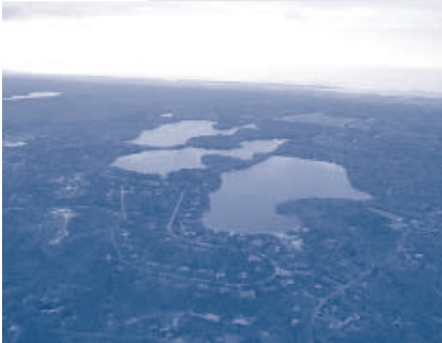
An aerial view of several freshwater bodies and nearby development

This year was also the second in which Commission staff coordinated a pond water-quality sampling "snapshot." Volunteers collected samples from more than 170 ponds with at least one pond sampled in every town (see this report's "Services to Towns" section). The University of Massachusetts-Dartmouth School of Marine Science and Technology again provided laboratory analyses of the samples. The program also received another grant this year from the Community Foundation to coordinate two pond workshops, print and distribute the atlas, coordinate the 2003 snapshot, and provide technical support to PALS groups.