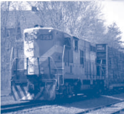
Cape Cod "trash train"

Toward the end of the fiscal year, the Commission's planning and transportation staff also initiated a study to compare the costs and benefits of hauling municipal solid waste off Cape by railroad versus truck.